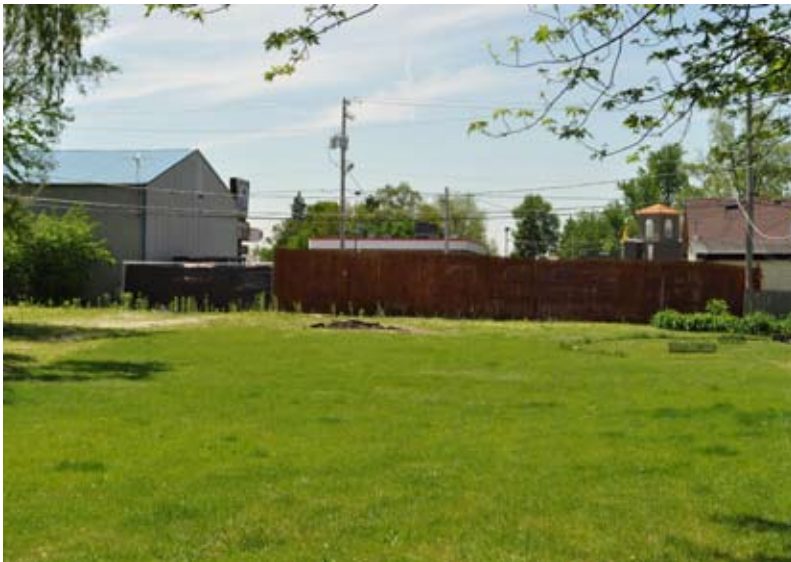
Vacant Lot Behind Retail