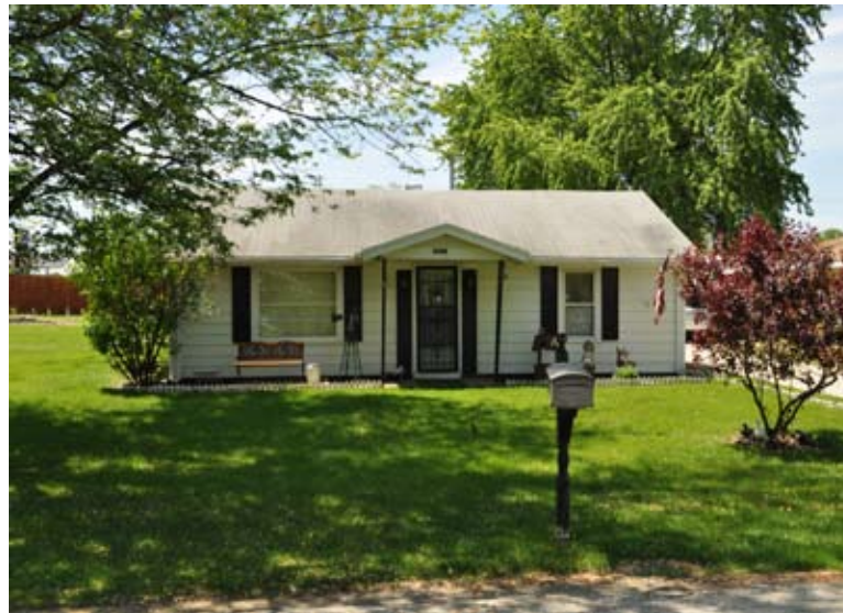
Rental House on Site